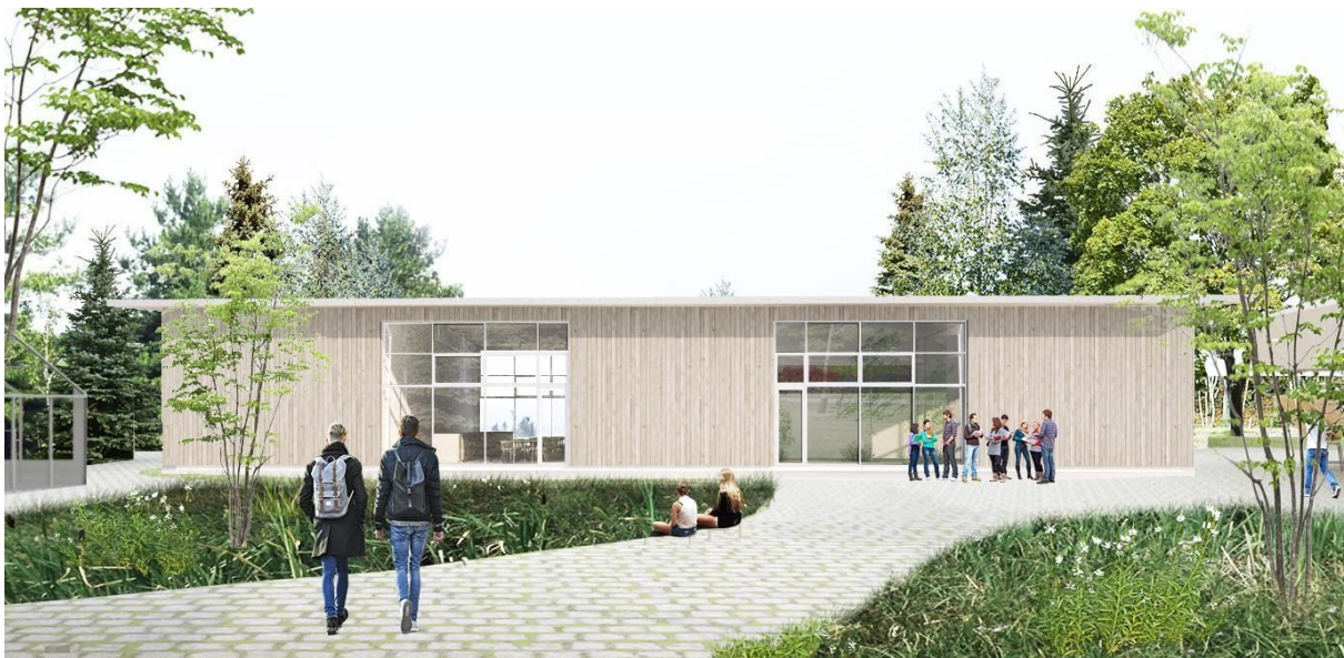
Rendering of the Grand Hall by Atelier Pierre Thibault

The "Grand Hall" is a new facility dedicated to events, workshops, lectures and spaces for creators and coworking. In keeping with the organization's commitment to sustainable development, an existing workshop built in the 1970's will be transformed to create the Grand Hall, minimizing the environmental footprint.